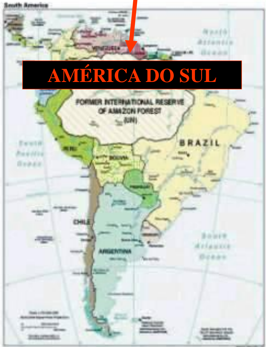
map 3.5-5.1- We can see the location of the International Reserve. It look area of eight South America's countries: Brazil, Bolivia, Peru, Colombia, Venezuela, Guyana, Guirame and F.Guyana. Some of the poorest and miserable countries of the world.

The creation of FINRAF were supported by all nations of G-23 and was really a special mission of our country and a gift of all the world, since the possession of these valuable lands to such primitive countries and people should condemn the lungs of the world to disappearance and full destroying in few years.