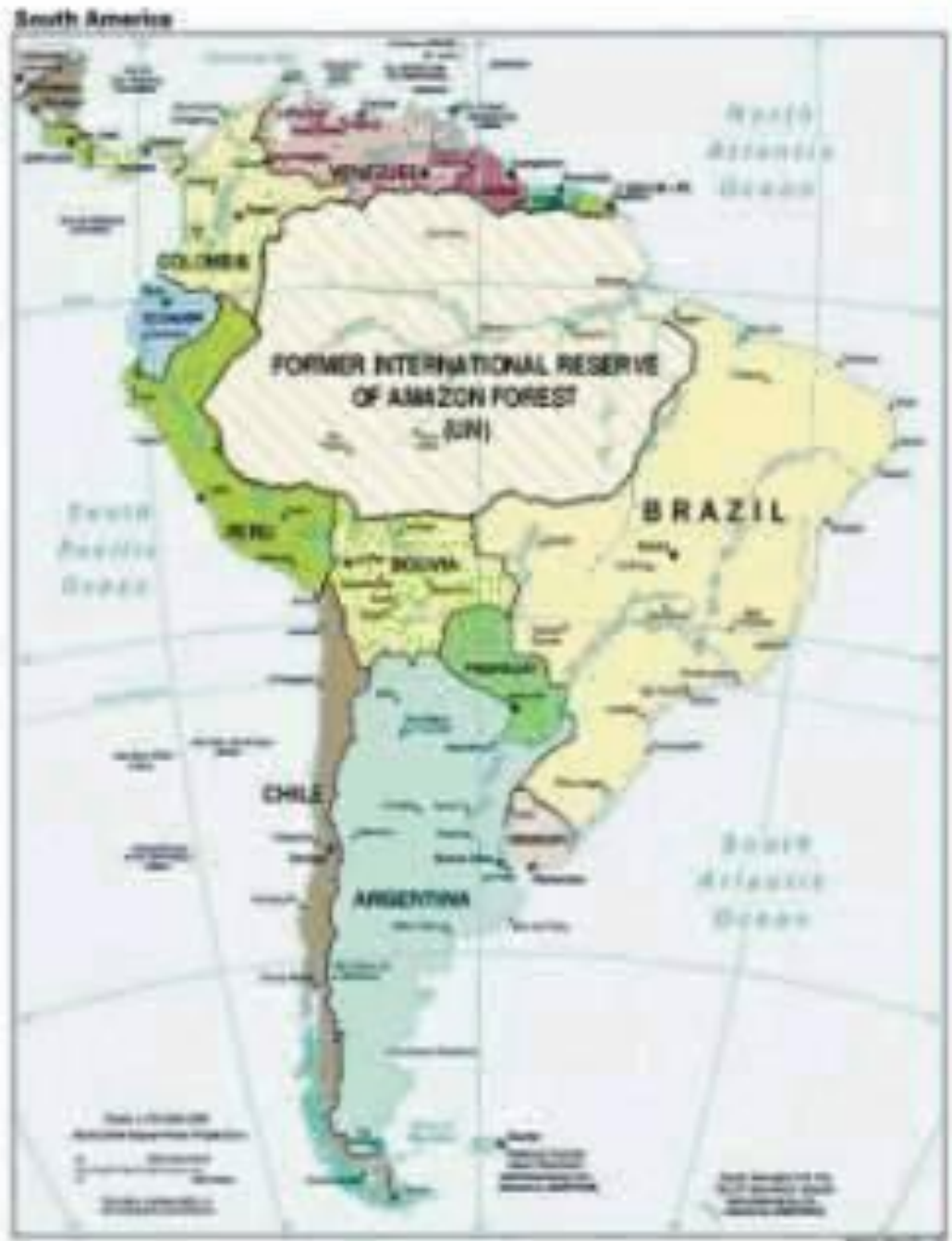
map 3.5-5.1- We can see the location of the International Reserve. It look area of eight South America's countries: Brazil, Bolivia, Peru, Colombia, Venezuela, Guyana, Guirame and F.Guyana. Some of the poorest and miserable countries of the world.

The creation of FINRAF were supported by all nations of G-23 and was really a special mission of our country and a gift of all the world, since the possession of these valuable lands to such primitive countries and people should condemn the lungs of the world to disappearance and full destroying in few years.