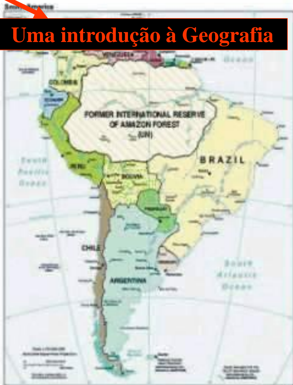
map 3.5-5.1- We can see the location of the International Reserve. It look area of eight South America's countries : Brazil, Bolivia, Peru, Colombia, Venezuela, Guyana, Guirame and F.Guyana. Some of the poorest and miserable countries of the world.

The creation of FINRAF were supported by all nations of G-23 and was really a special mission of our country and a gift of all the world, since the possession of these valuable lands to such primitive countries and people should condemn the lungs of the world to disappearance and full destroying in few years.